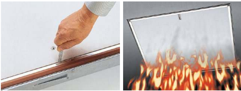
Grab Handle for removing the fire protection panel.