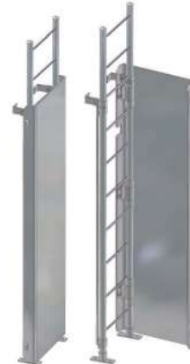
SL/LG LADDER GUARD The padlockable ladder guard designed to fit onto our SL ladders to prevent unauthorized use. LG2 - 2m long, LG25 - 2.5m long.