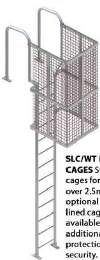
SLC/WT LADDER CAGES Standard cages for ladders over 2.5m high or optional mesh lined cages are available for additional protection and security.