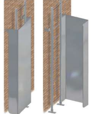
SL/LGW LADDER GUARD WALL MOUNTED The padlockable wall mounted ladder guard designed to fit over any existing ladder to prevent unauthorized use. LG2 - 2m long, LG25 - 2.5m long.