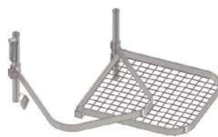
SLC/SC SECURITY CLOSURE Surespan padlock security closure for caged ladders to prevent unauthorised entry onto the ladder.