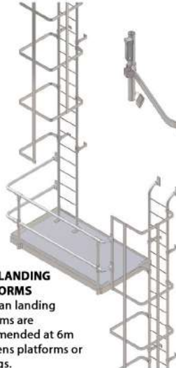
SLC/P LANDING PLATFORMS Surespan landing platforms are recommended at 6m between platforms or landings.