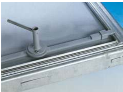
Type SBV-GDZ central lock from underneath