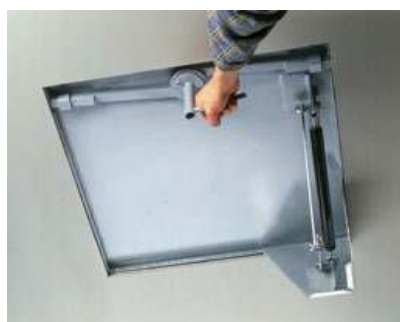
Type SBV-GDZ to be opened from the underside with the central lock

Loading Capacity: 125 kN test load (per EN124) when filled with grade C35/45 Concrete (EN 206)