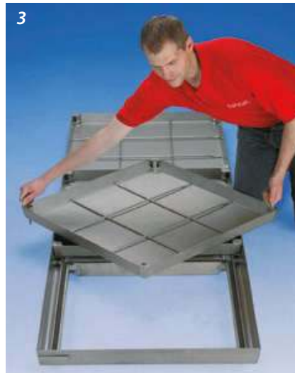
Figure 1: Cover Removed Figure 2 & 3: Removing a cross beam