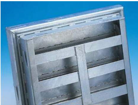
Type SBVHS-400 Bottom with additional frame, reinforced with IPE-beam section and flat steel

Loading Capacity: 400 kN test load (per EN124) when filled with grade C35/45 Concrete (EN 206)