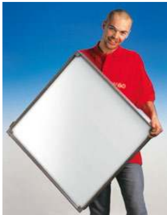
Type SCLA composite light The super-light weight cover

Installation: Installation must be carried out according to instructions. With water-tight models, care must be taken to seal the outer frame into the surrounding flooring and to fill the cover with water-tight concrete.