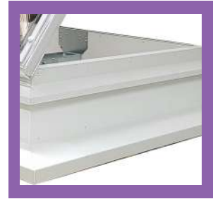
Optional External Curb to suit weathered upstand