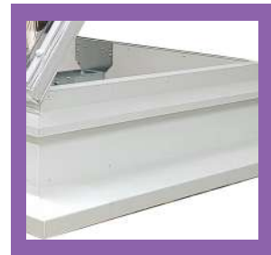
Optional External Curb to suit weathered upstand