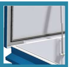
Double Unbroken welded Seals