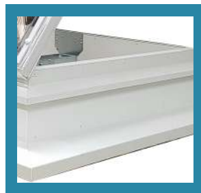
Optional External Curb to suit weathered upstand