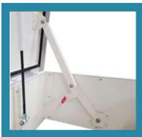
Secure Stay Hold Open Arm with smooth manual closing using grip handle.